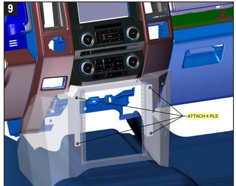
9. Attach the Console to the Console Support Bracket with provided hardware.

If you have questions or need further assistance please call Technical Support: 1.877.455.6886