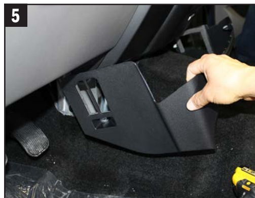
5. Remove (1) 10 mm screw holding the lower trim in place rotate over the transmission hump and unsnap from the passenger side.