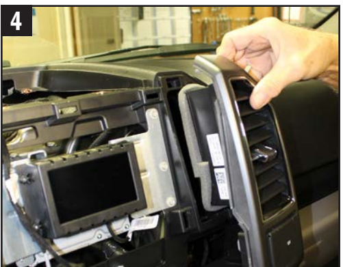
4. Remove the left and right climate sections containing the 12"volt plug and the 4x4 knob selector, unplugging each from the wiring harness.