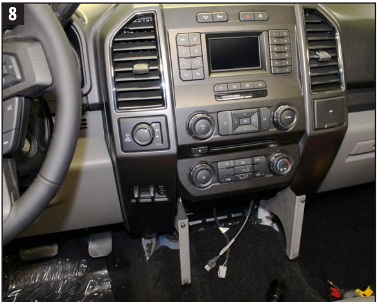
8. Replace trim components that were removed in steps 1, 2, 3 and 4.