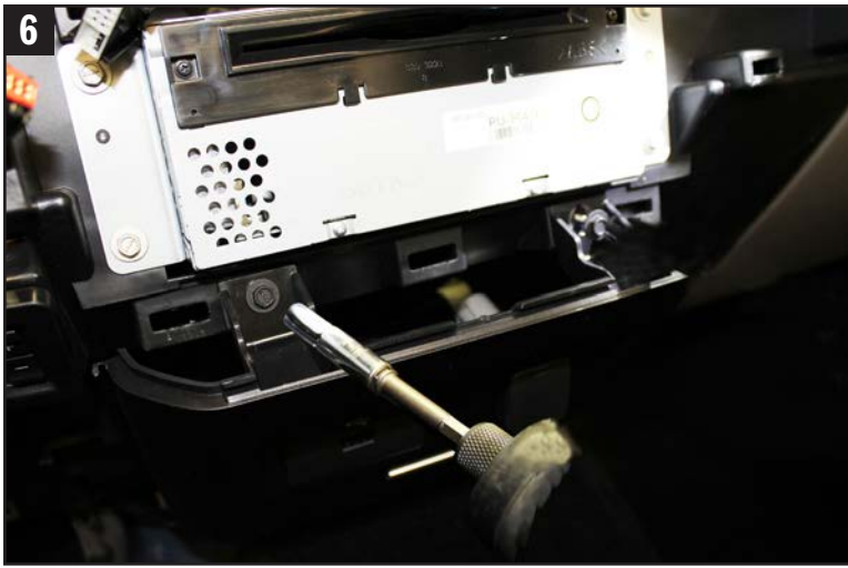
6. Remove lower panel containing 12 volt power and USB by unscrewing (2) 7 mm screws on the top and (2) 10 mm screws on the bottom. Unplug accessories from harness.