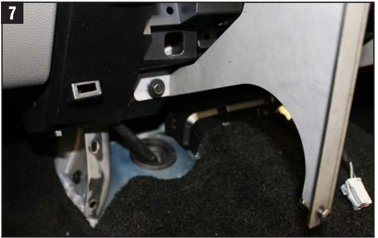
7. Install the Console Support Bracket with the previously removed 7 mm and 10 mm OEM screws from step 6.