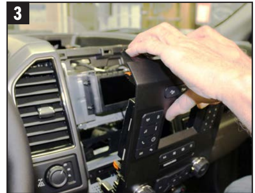
3. Pry from the top to unsnap the trim covering the radio and climate controls. Unplug the heater control from the harness.