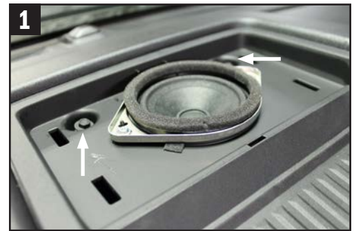
1. Unsnap speaker cover from each side corner to remove (2) 7 mm screws.