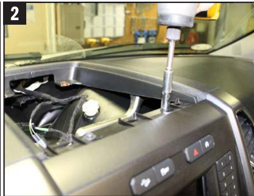
2. Pry the top tray up from each front corner and remove the (2) 7 mm screws. Unplug speaker from the harness.