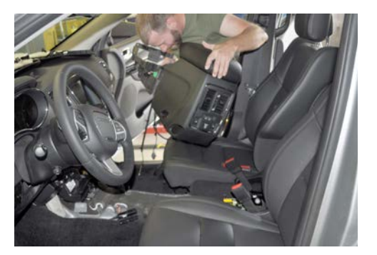
Remove OEM console from vehicle.