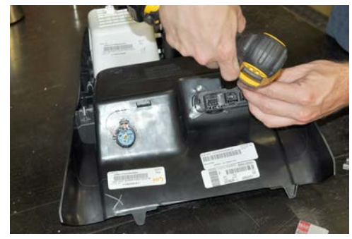
Using a T20 bit, remove (4) screws and set aside media component to remount into Contour Console.