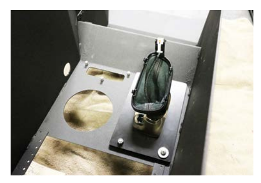
With the console turned over, install the boot and shifter and re-tighten T-20 screws. Snap the boot clips into the Filler Plate.