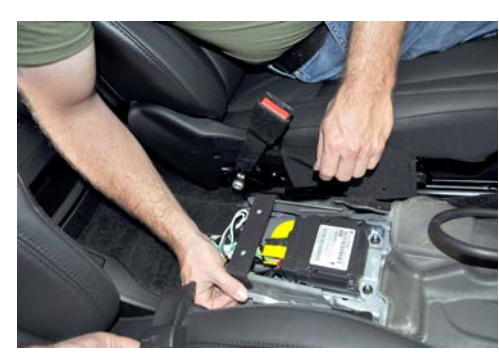
Attach Rear Mount Bracket with OEM (2) 10mm bolts.

Console. Note: See owner's manual section "What To Do In Emergencies" for more Park Release information.