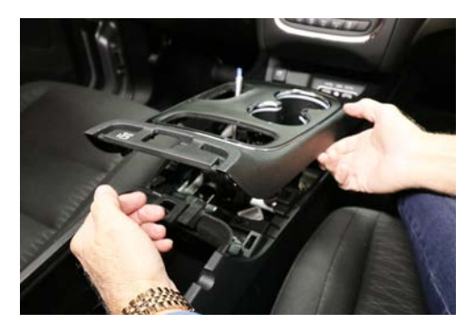
Pry up top/center OEM console. Disconnect all wires from top cover.