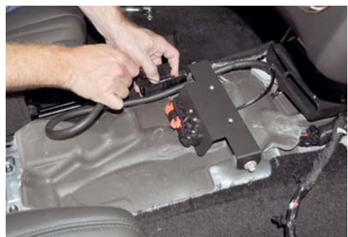
Attach Forward Mount Bracket into vehicle reusing (2) 10mm bolts. Once installed, route/connect Manual Park Release cable making sure that wire will not be pinched by Jotto Desk Contour