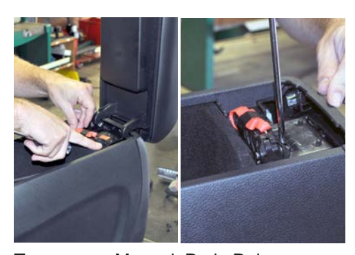
To remove Manual Park Release, you will need to remove (3) Phillips screws and set arm rest aside. Then remove (2) Phillips screws that are exposed.

Note: See owner's manual section "What To Do In Emergencies" for more Park Release information.