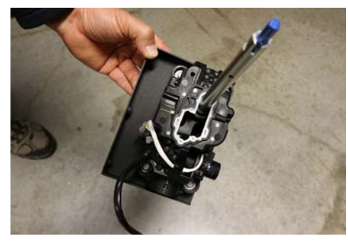
Secure shifter to Mount Plate with factory OEM bolts.