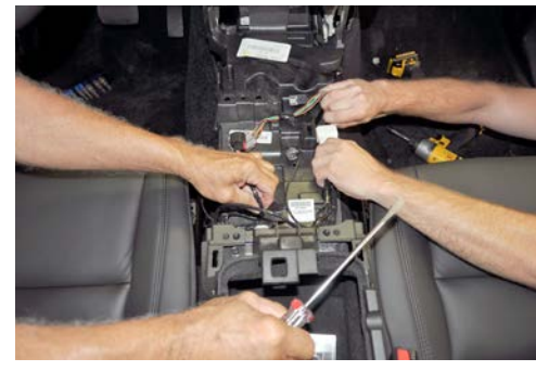
Disconnect wiring harnesses and harness clips.