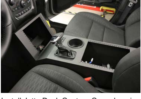
Install Jotto Desk Contour Console using 5/16 button head cap screws.