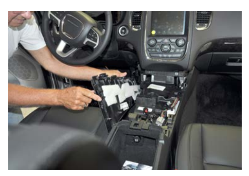
Pop off front left/right side panels from OEM console.