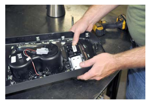
Traction switch/coin tray will pop out from underside of OEM console. Set aside.

Note: Some vehicles may have a coin tray only without Traction Switch.