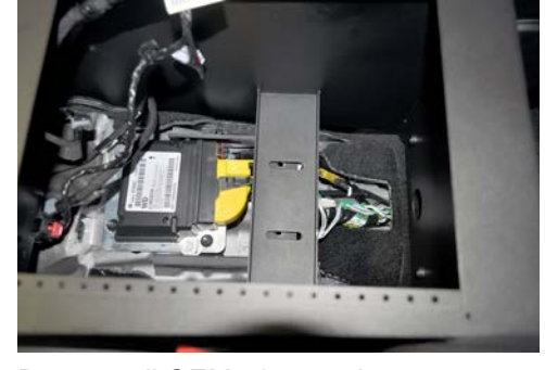
Reroute all OEM wires and reconnect.