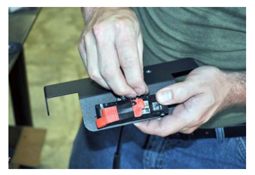
Using 5/16" hex head bolts, attach Manual Park Release to Forward Mount Bracket.