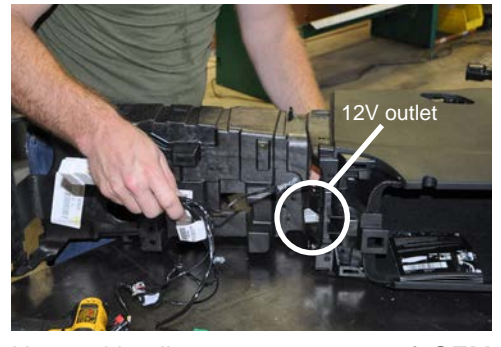
Now, with all components out of OEM console, remove any remaining wiring and 12V outlet from inside storage box. Set aside OEM console substructure.