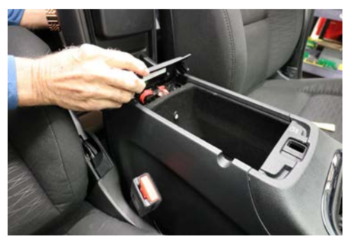
Pry up manual neutral cover located under armrest near the hinge.