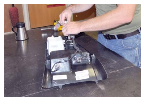
With OEM console out of vehicle, begin to remove all components from console. First, remove media wire harness.