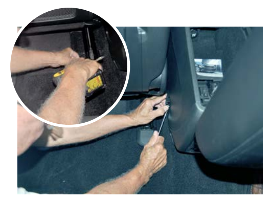
Move seats forward, use a flat head screw driver to expose and then remove (2) 10mm bolts.