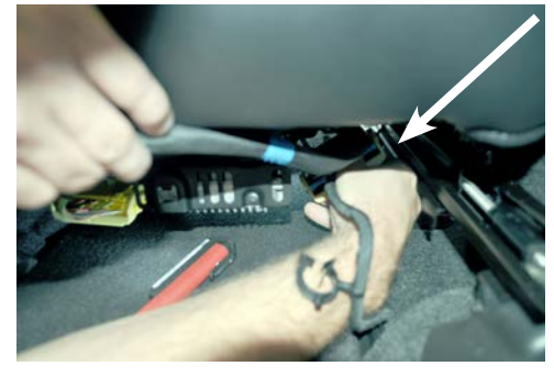
Disconnect wire harness under P/S seat by unlocking the lever, and pulling wire connector apart.