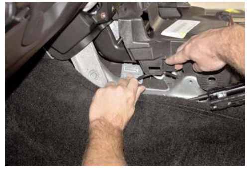
On the driver side of center console, unsnap Manual Park Release cable from OEM substructure.