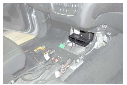
Install foam insert into open duct.

Console. Note: See owner's manual section "What To Do In Emergencies" for more Park Release information.