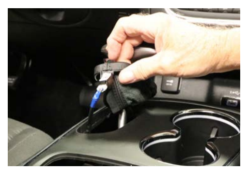
Pop up shifter boot. Unscrew bolt on shifter with T20 bit and unplug wire cord.