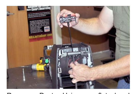
Remove Duct. Using a flat head screwdriver, pop out clips holding cable in place. Then pull cable through, and remove cable clips. Set aside Manual Park Release to be reinstalled into the Contour Console.

Note: See owner's manual section "What To Do In Emergencies" for more Park Release information.