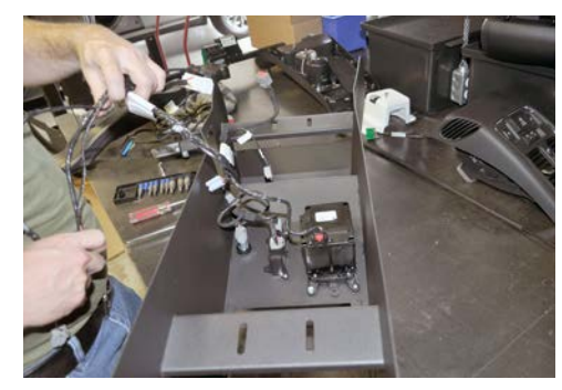
Reinstall components back into Jotto Desk Contour Console using the same hardware from OEM console.