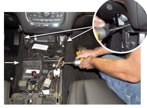
Remove (2) 10mm bolts and (2) 7mm bolts.