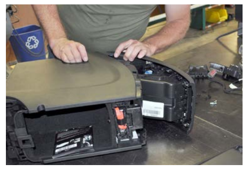
Now pry rear OEM cover from console.

Note: Some vehicles may have a coin tray only without Traction Switch.